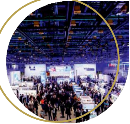
Fairs & Events