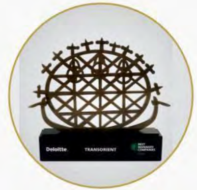
Best Managed Companies ( DELOITTE ) 2019