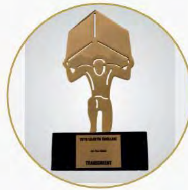
Jury Special Project Awards- Biopharma ( ATLAS LOGISTICS ) 2018