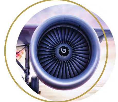
Aviation & Defense