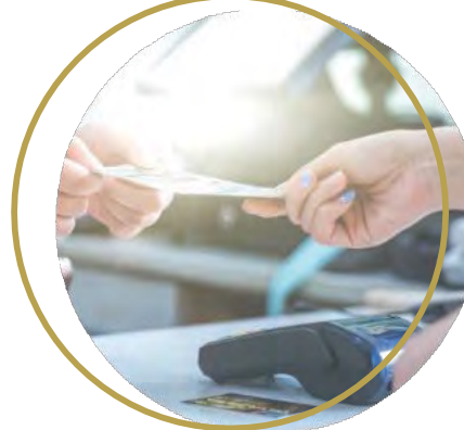
Retail & Consumer