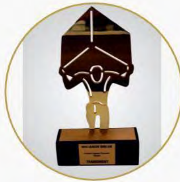
Railway Forwarder of the Year Award ( ATLAS LOGISTICS ) 2016