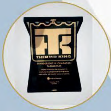
Thermo King Cold Cube Certificate ( DOĞUŞ AUTO ) 2015