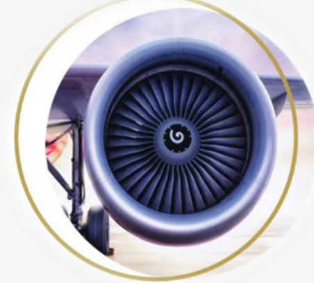
Aviation & Defense