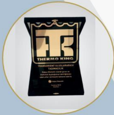
Thermo King Cold Cube Certificate ( DOĞUŞ AUTO ) 2015