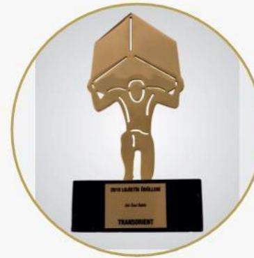
Jury Special Project Awards- Biopharma ( ATLAS LOGISTICS ) 2018