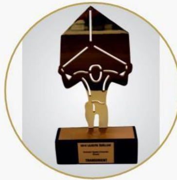
Railway Forwarder of the Year Award ( ATLAS LOGISTICS ) 2016