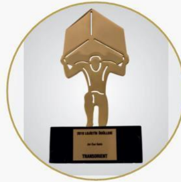
Jury Special Project Awards-Biopharma ( ATLAS LOGISTICS ) 2018