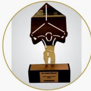
Railway Forwarder of the Year Award ( ATLAS LOGISTICS ) 2016