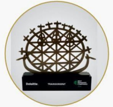
Best Managed Companies ( DELOITTE ) 2019-2025